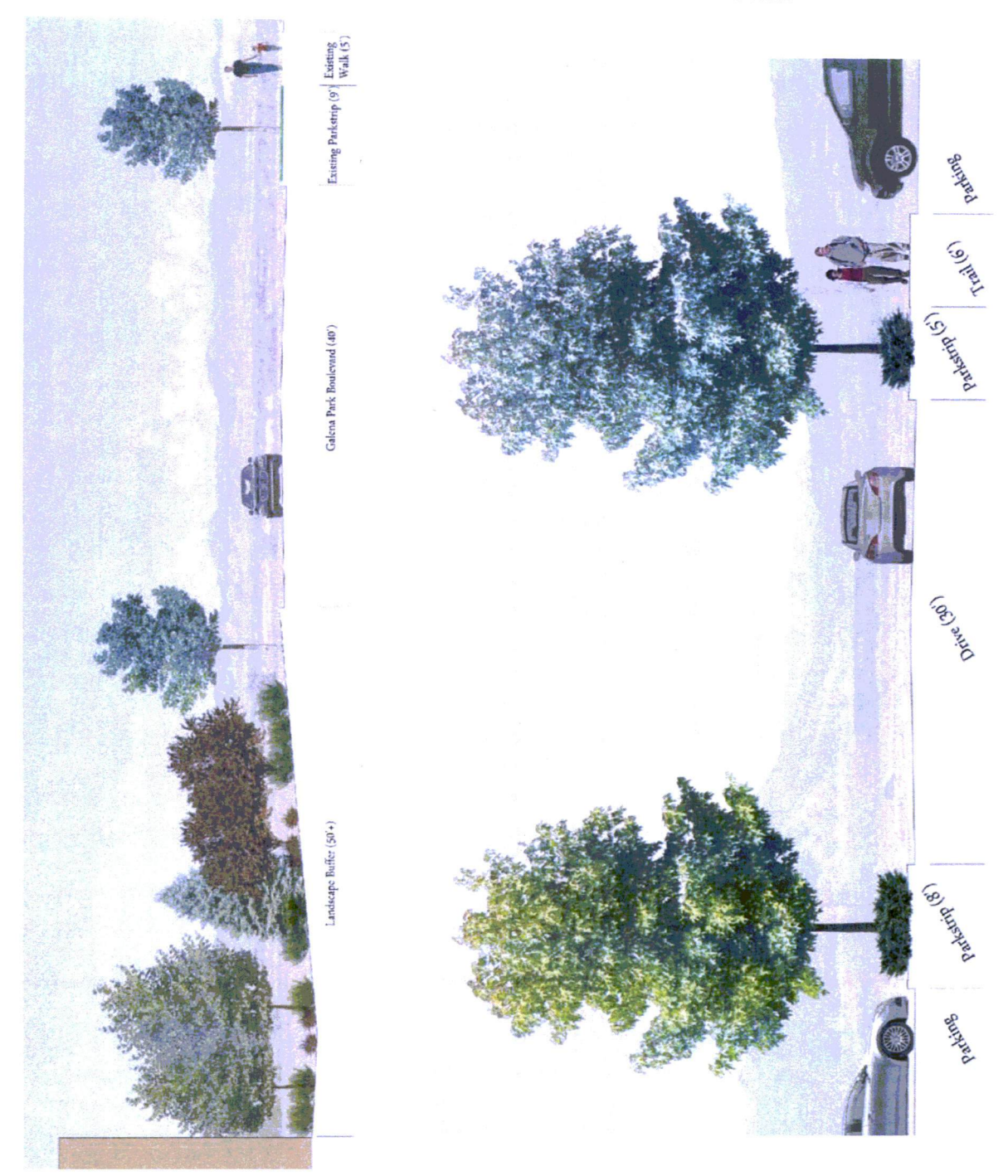
"Main East/West Corridor"